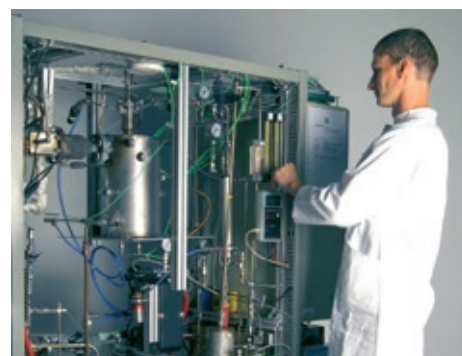
Fully automated system for autothermal reforming of desulphurized kerosene Jet A-1 to supply a SOFC.