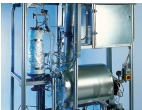
Test stand for autothermal reforming of diesel for use on ships.