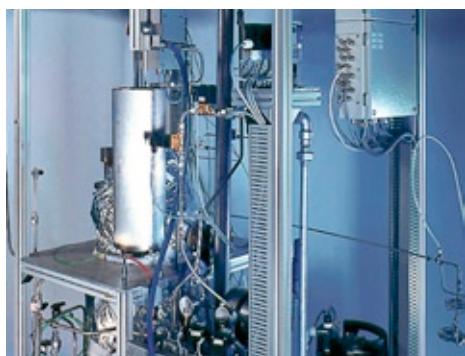
Fully automated test stand for steam reforming of natural gas.